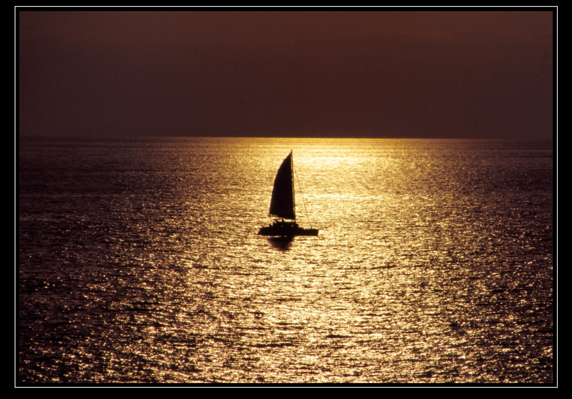
The Divine does not sparkle and glitter, if you put gold in your pockets. Sailor enjoys gigantic sunset at Capo Testa in the very far North of Sardinia – October 2009