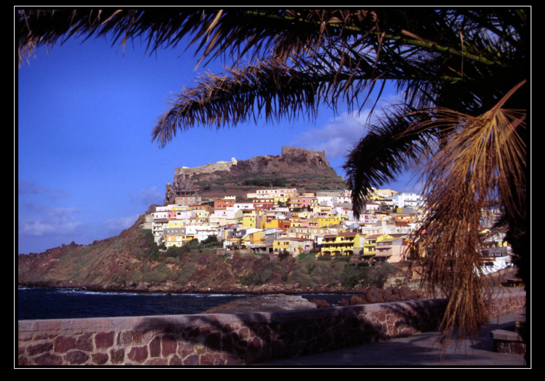
② If you hide inside, you will not meet someone, you can show you inner splendor. ② Evening moods amongst the colorful houses of Castelsardo with its eponymous castle in the North of Sardinia – October 2009