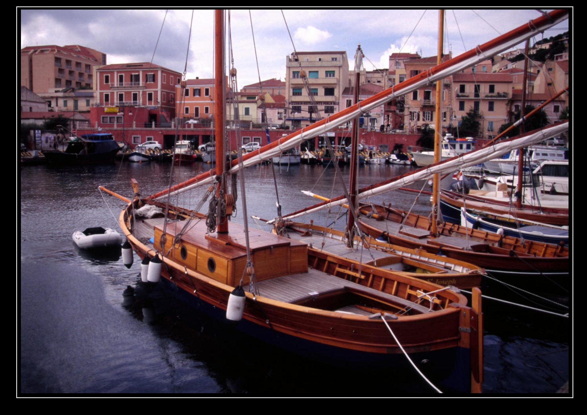
Find the harbor of your destination and you won't be afraid of hitting the road. ☺ Old harbor of La Maddalena on the correspondent island in the North of Sardinia – October 2009