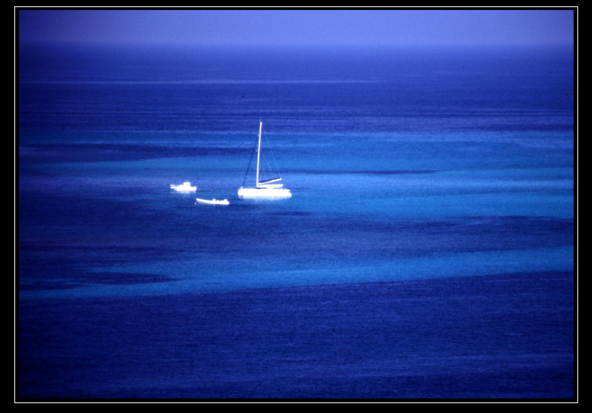
© Decide consciously, where you let go your anchor. © Sailing boots of the Jet set lie in front of the Caribbean-like bay of Capo del Falcone in the North-West of Sardinia – October 2009