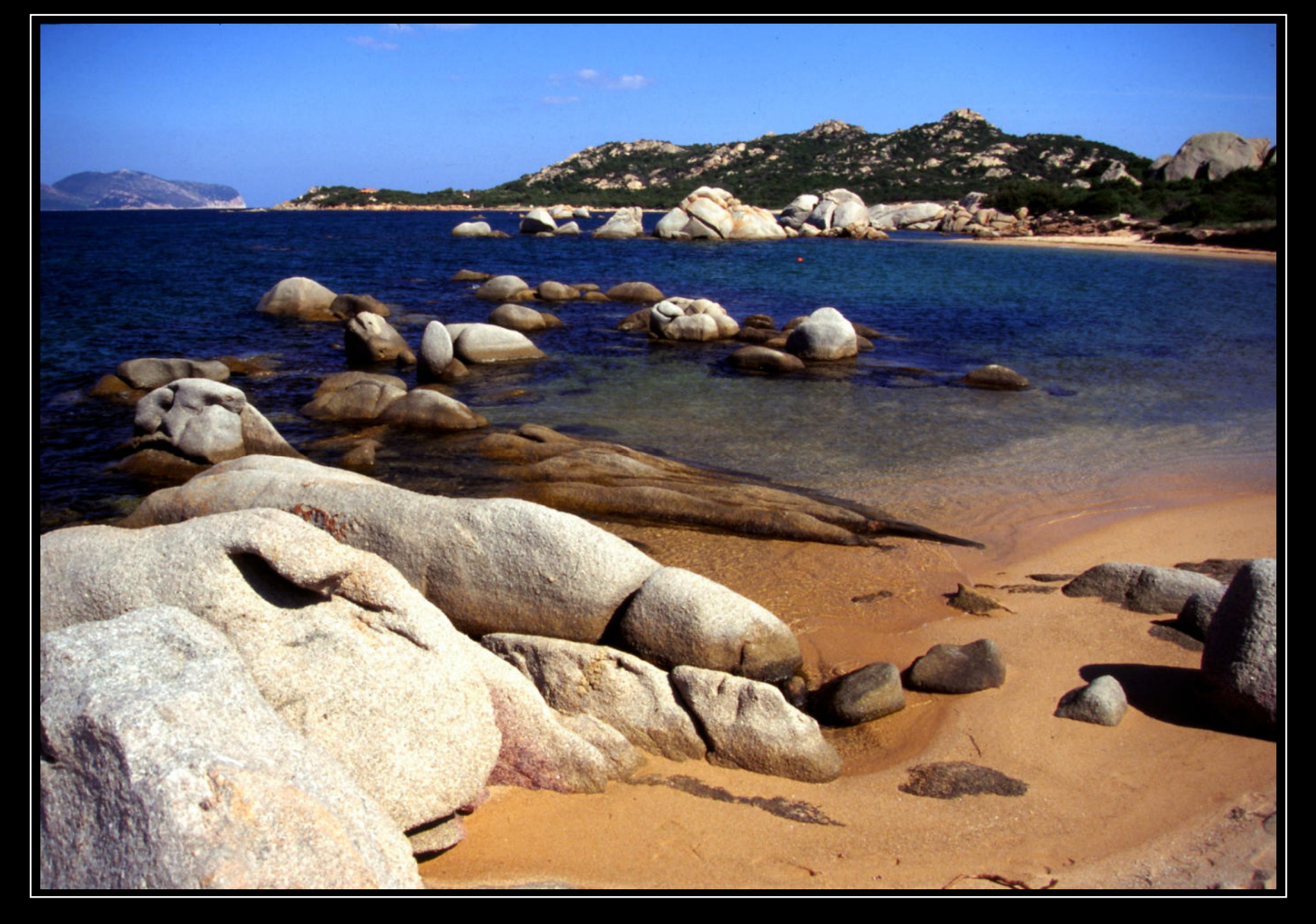
Not the clear route will help you to attain your goals, but the first brave step. © Awesome bay for climbing and hiking in front of our hotel Li Cuncchedi in the North-East of Sardinia nearby Olbia – October 2009