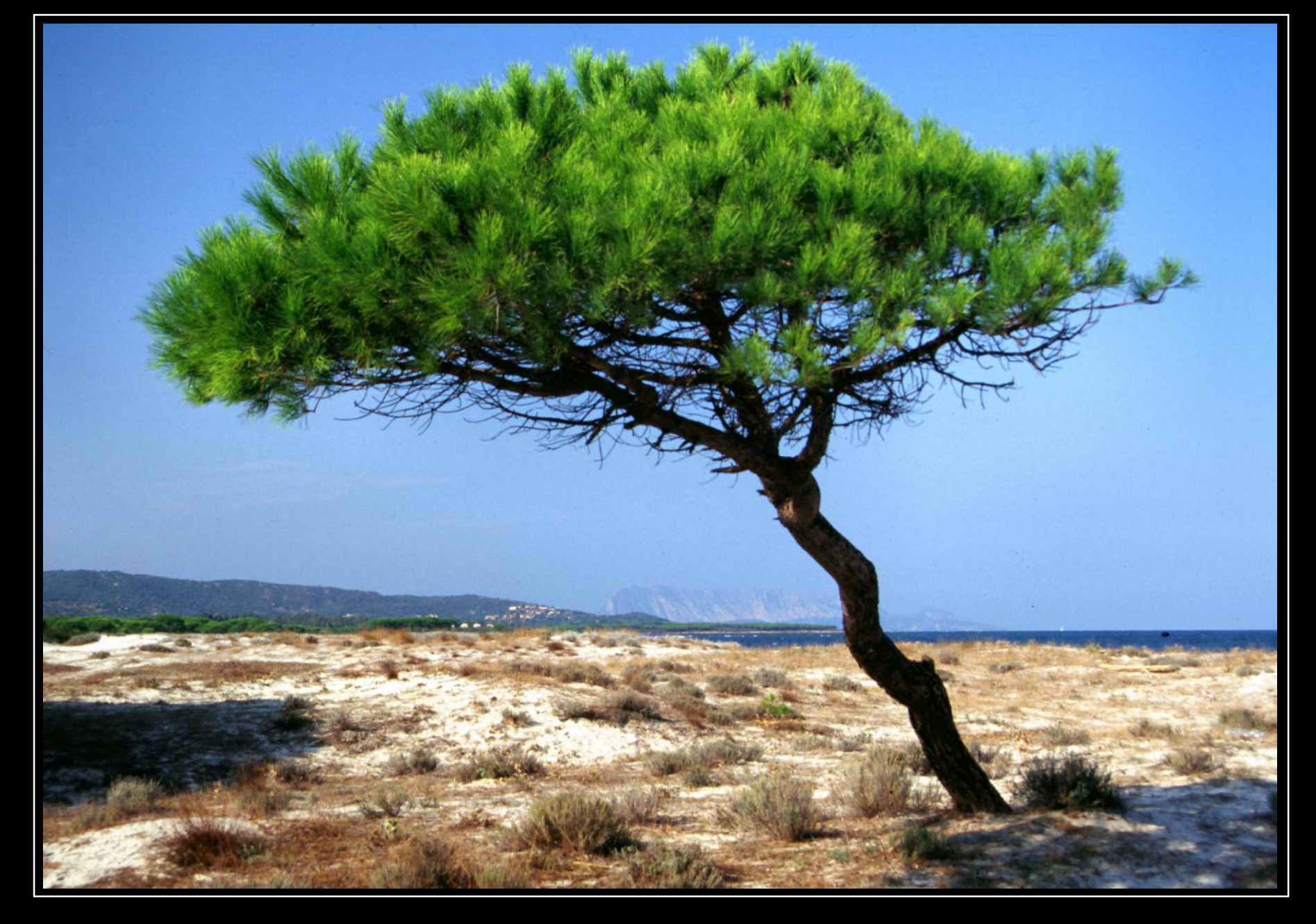
● If you want to unfold freely, you must be able to stand alone. ⑤ Single, but not lonesome pine tree at the family beach of Budoni in the North-West of Sardinia – October 2009