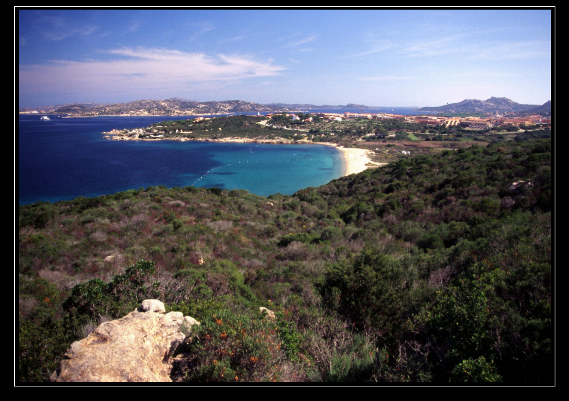
Welcome to Sardinia, a paradise, surrounded by stony history and fabulous beaches. ☺ View on the lagunic bay of Palau from a viewing point in Porto Rafael in the north of Sardinia – October 2009