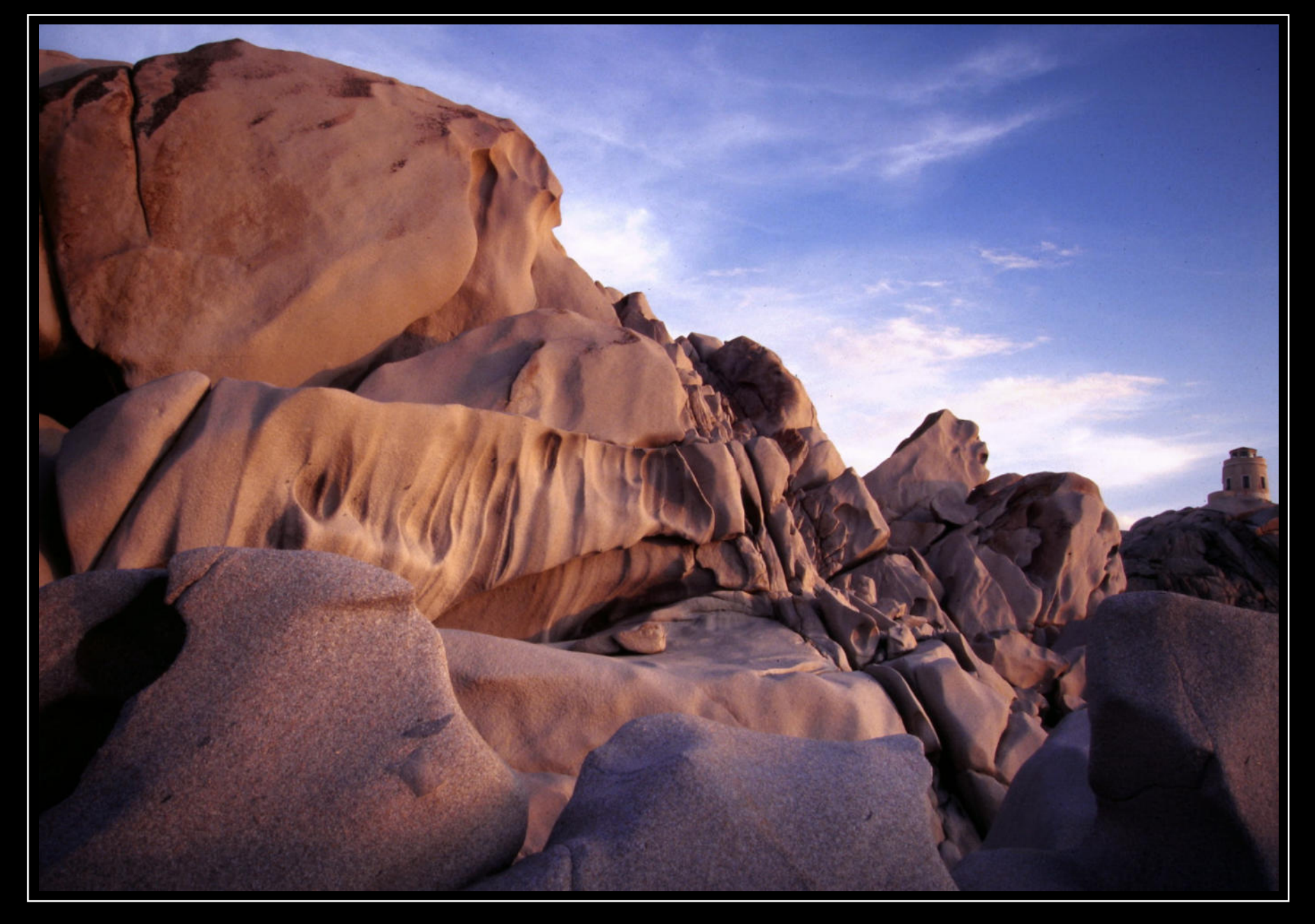
© Each obstacle is only as big as your mind allows it to be. ☺ Unbelievable scenery of rocks and stones at Capo Testa with lighthouse at the back, the most northern part of Sardinia – October 2009