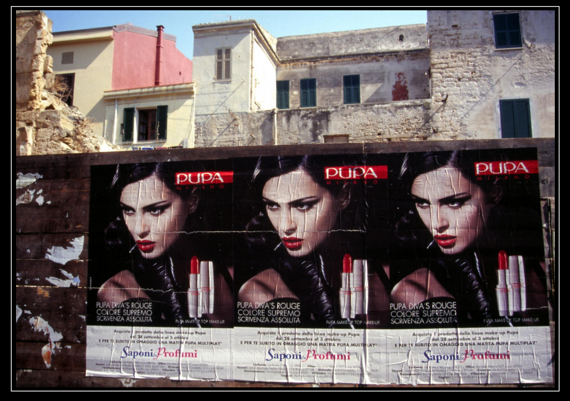
© Erotic begins, when the lipstick realizes its limits. © Seductive poster in triple pack in the old city of Alghero in the North-West of Sardinia – October 2009