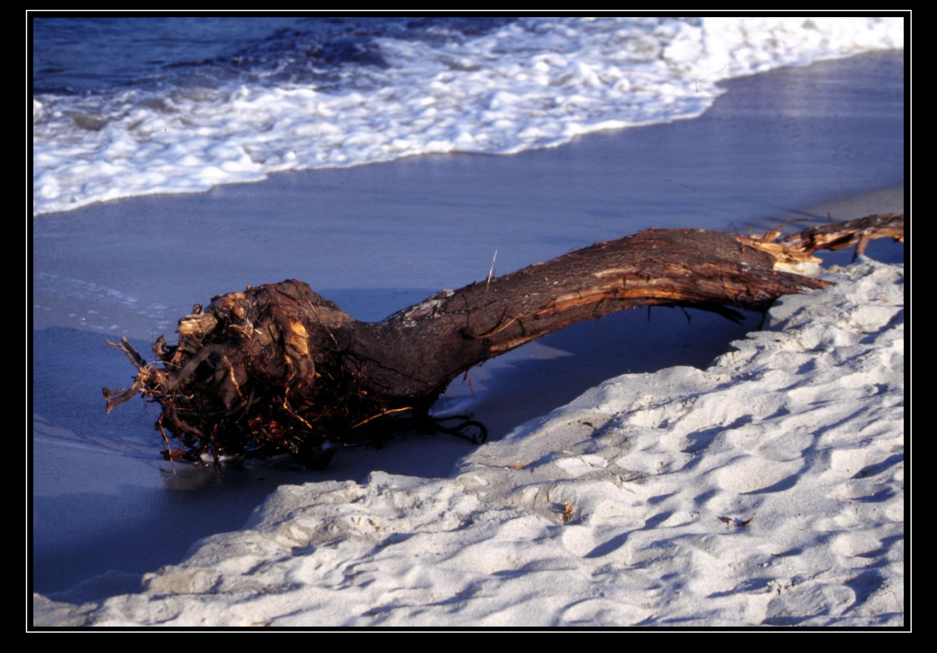
Let yourself drift without becoming driftwood. © Stranded tree trunk at the stunning beach of Budoni in the North-East of Sardinia – October 2009