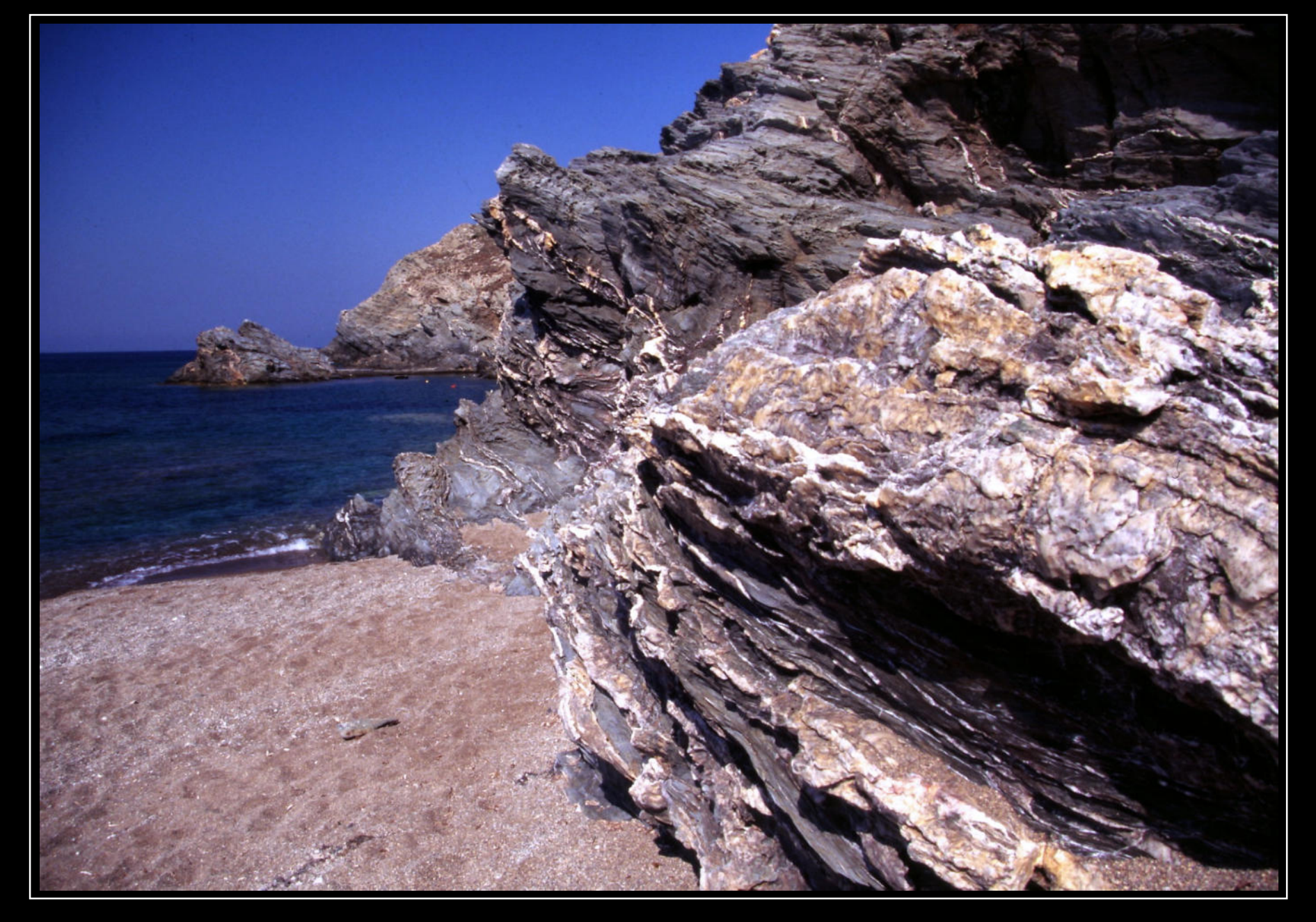
© Discover the purpose of your existence in the forms, gorges and colors of your life story. © Bizarre rock formations in the volcanic bay of the former mining town of Argentiera in the West of Sardinia – October 2009