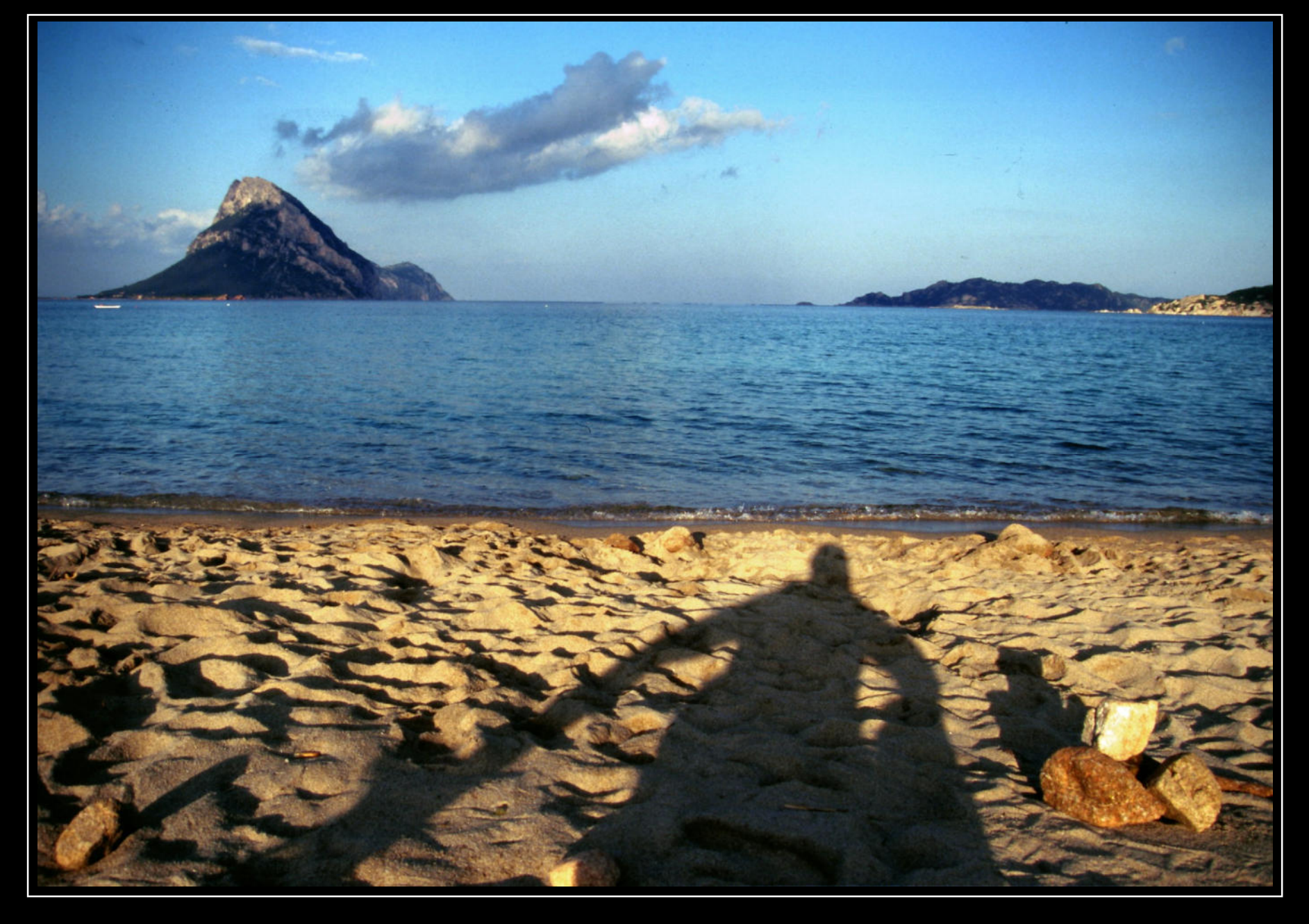
Let the legacy of your past behind and set out for your longing and yearning in the distance. Bonus-Picture: The evening sun shines on the distintive silhoutte of the island Tavolara, being under nature protection – October 2009