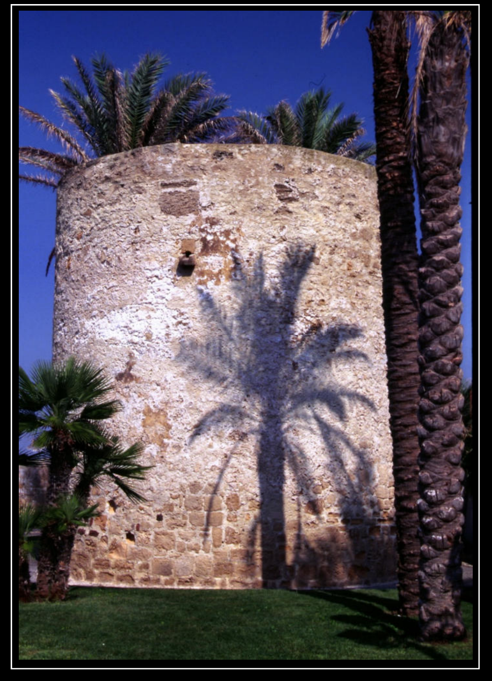
© Embrace you dark sides. They show you the way into the light. © One of the towers for the fortress in the wonderful old city of Alghero in the North-West of Sardinia – October 2009